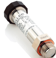
Series 35 X G1/2", flush diaphragm