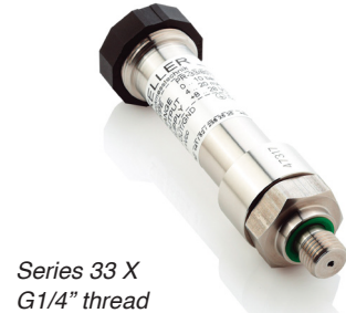
Series 33 X G1/4" thread

The transmitter's full-scale output can be set up to match any standard of your choice by correcting the gain with the PROG30 software.