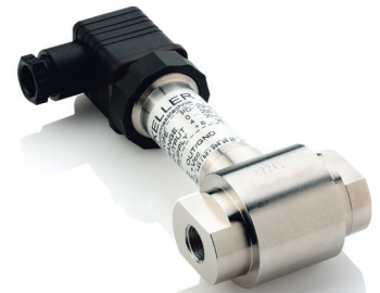
Series PD-33 X