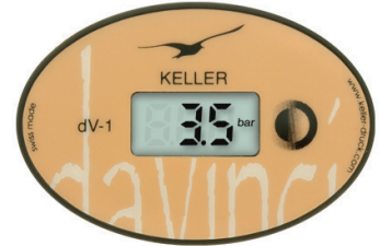
dV-1 in oval housing with battery compartment and pressure connection nipple, ø 5 mm